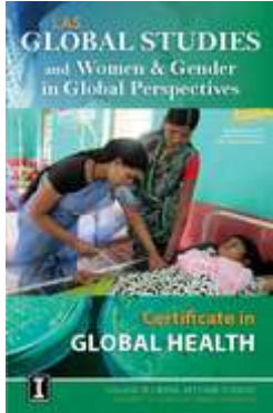
Certificate in Global Health