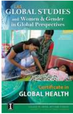
Certificate in Global Health

Click for more information on Undergraduate Certificate