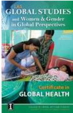
Certificate in Global Health