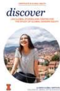
Certificate in Global Health

Please, click here to learn more about the GRID Minor